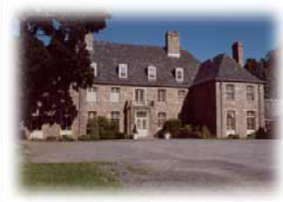
Our new home ...

Friendship Ambassadors Foundation at Wainwright House, 260 Stuyvesant Avenue Milton Point, Rye, New York 10580