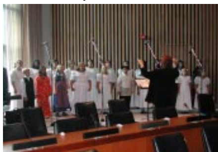
The famed World Children's Choir of Washington D.C. at an FAF produced event in the United Nations, August 2004

FAF' staff include IATA travel agents, tour operators, destination managers worldwide, affiliates of the United Nations, faculty & scholars worldwide.