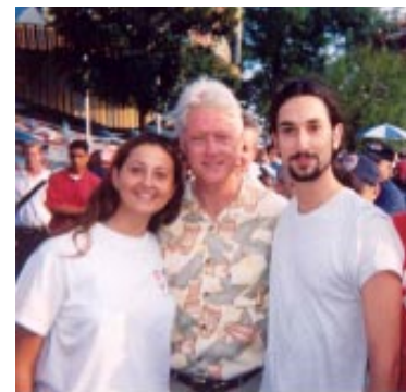
FAF youth counselors with the former President during a 9/11 summer get-a-way.

"Friendship Ambassadors Foundation ... its mission is so important, and ... you are accomplishing remarkable things. Best wishes to you and everyone at the foundation!"