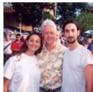
FAF youth counselors with the former President during a 9/11 summer get-a-way.

William Jefferson Clinton, January 26, 2004