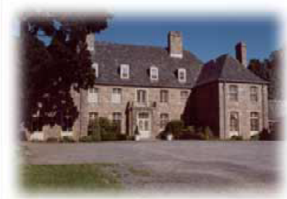
Our new home ...

Friendship Ambassadors Foundation at Wainwright House, 260 Stuyvesant Avenue Milton Point, Rye, New York 10580