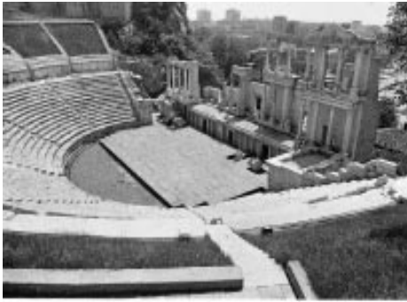
Imagine performing in a 3,000 year old Roman Amphitheatre!

Visit exotic, emerging Bulgaria in January, May, or June (extensions available) with your choir, orchestra or dance company and perform with other ensembles and solo artists from around the world! Professional and educational companies invited. Performances to take place in Sofia and Plovdiv (a 7,000+ year old city with strong cultural as well as historical perspective).