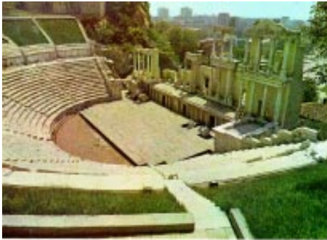
Imagine performing in a 3,000 year old Roman Amphitheatre!

Visit exotic, emerging Bulgaria June 5-15 (extensions available) with your choir, orchestra or dance company and perform with other ensembles and solo artists from around the world! Professional and educational companies invited. Performances to take place in Sofia and Plovdiv (a 7,000 year old city with strong cultural as well as historical perspective).