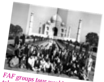
FAF groups tour worldwide and also take advantage of cultural exchange, a mainstay of all FAF tours

We hope you will join FAF this year in a global, cultural exchange or concert tour. Either to one of our international destinations or, this year for the first time ever, in a memorial tour to our home city of Manhattan. Like these intrepid seniors, FAF believes it is time to recommit to cultural exchange in one form or another, in one place or another, as our contribution to a better world.